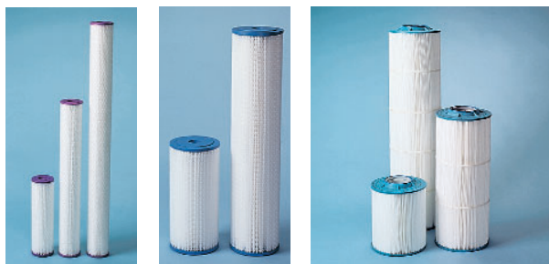
Standard (2-3/4" O.D.)

POLY-PLEAT™ cartridges are available in the following types for a variety of filter housings: