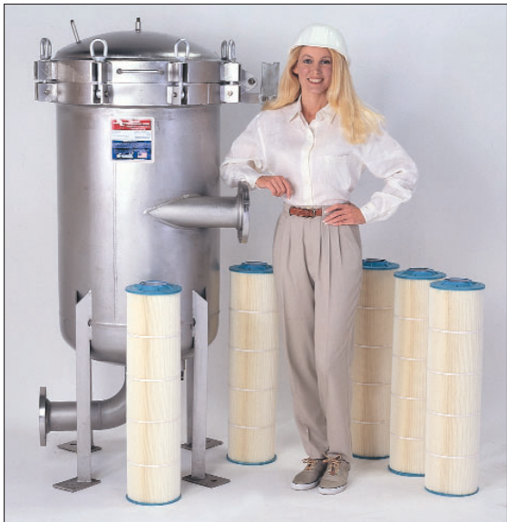
Harmsco HUR-850-ASME filter

POLY-PLEAT™ Cartridges are ideal for municipal water filtration using Harmsco's HUR-850-ASME filter housing shown below.