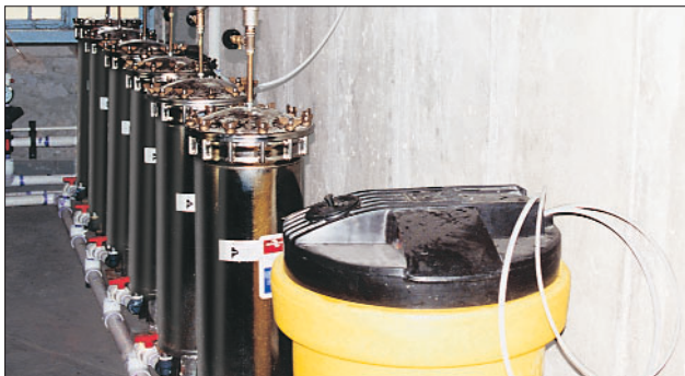
Sandbar State Park, Milton, VT

Following is a typical installation where POLY-PLEAT™ cartridges are used.